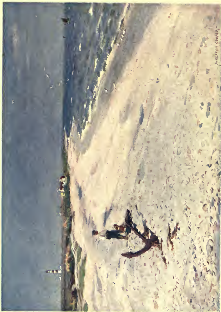
A BREEZY MORNING AT POINT OF AYRE. The northern extremity of the Isle of Man with its lighthouse.